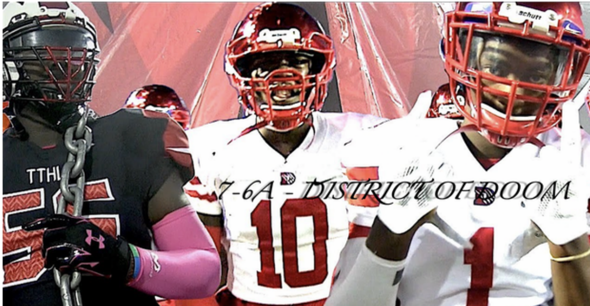
Cedar Hill, one of several frightening teams in the so-called "District of Doom."

Football is back and every team in every district is ready to rock.